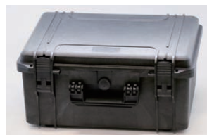
Hard Carrying Case