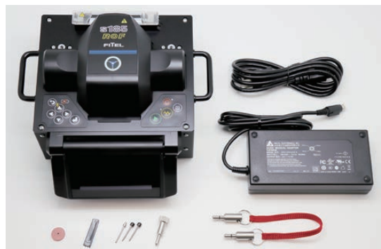
Standard Package (S185ROF)